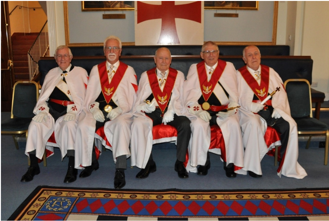
Knights promoted at the September meeting of the Prefectory St George at London No.1.

The next item on the agenda was to appoint and invest Prefecture Officers for 2024-25.