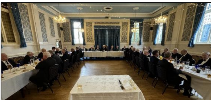
The Haggis was then paraded round the dining room led by the two Pipers.