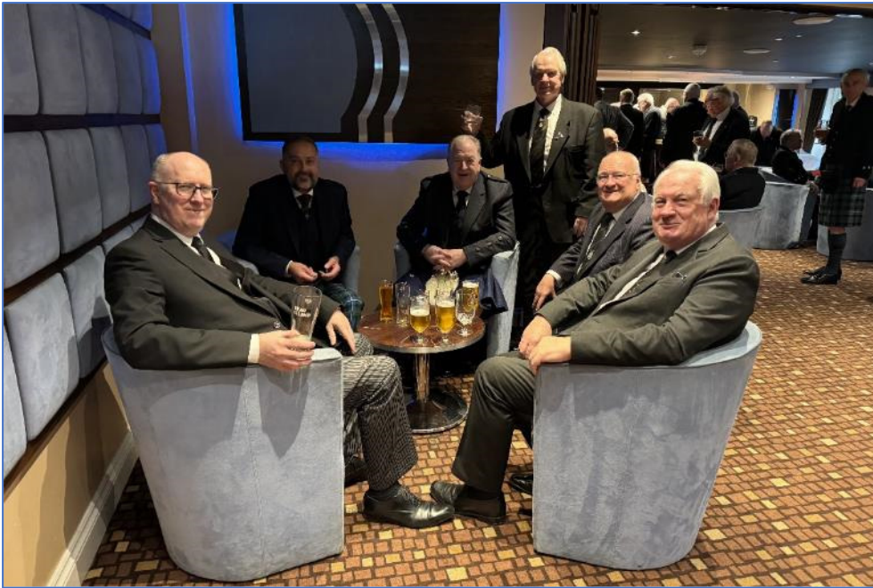
After refreshments in the bar, with an opportunity to catch up with everyone....