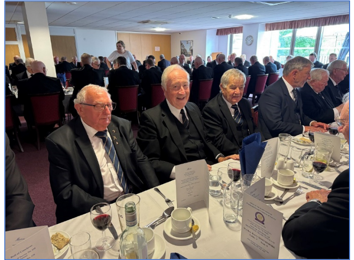
After the meal the Provincial Grand Supreme Ruler had pleasure in presenting gifts to the Grand Supreme Ruler and his Director of Ceremonies in appreciation for making this a day to remember for Surrey.