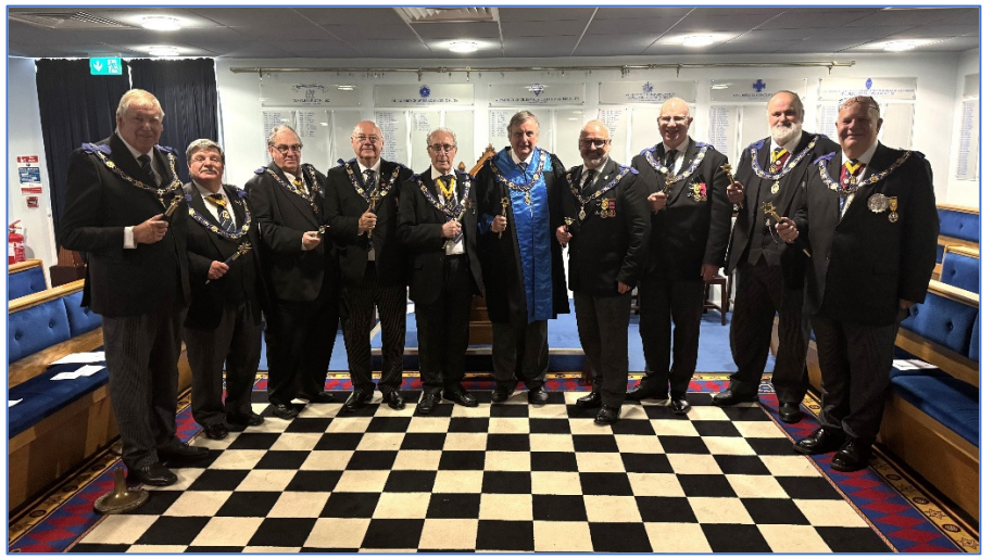
Following refreshments in the bar the members of the Province, their visitors and guests sat down to a most enjoyable luncheon at the Guildford Masonic Centre