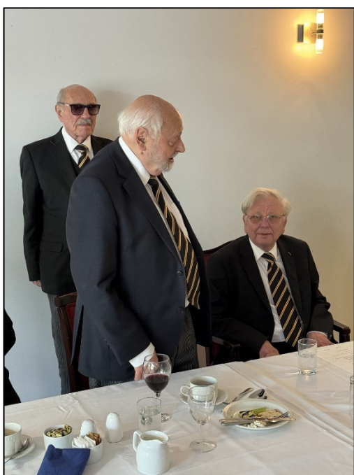
.... the Companions of Guildford Consistory and their guests enjoyed a convivial lunch together at the Guildford Masonic Centre.