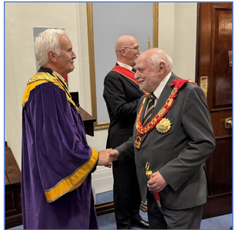
After the ceremony the Consistory was closed by the Grand Summus who retired from the Temple, greeting everyone on the way out. The Grand Summus afterwards returned for a group photograph with the Surrey Companions.