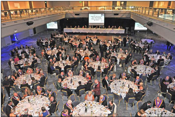
At 7:30pm we were called to dinner in the Oxford Room.