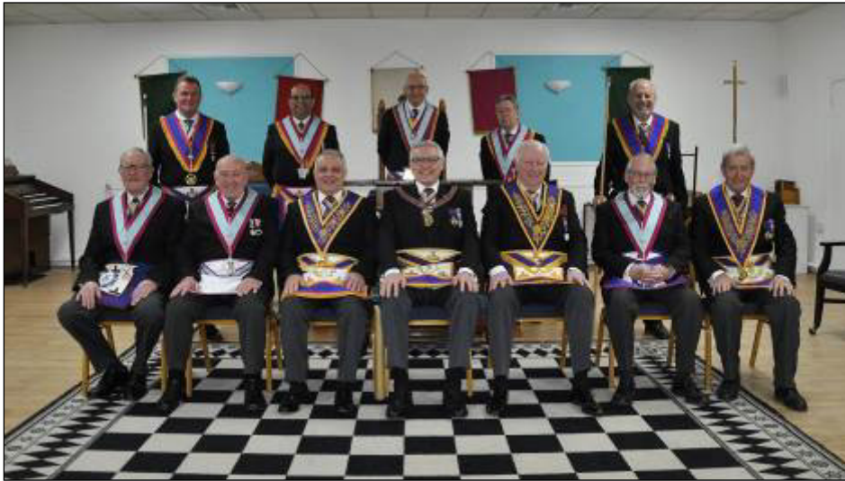
Sanderstead Mark Lodge Members and the Provincial Team at the final meeting of the Lodge on the 9 th of March 2023