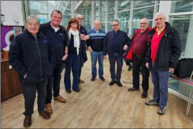
There were several families there with their children.