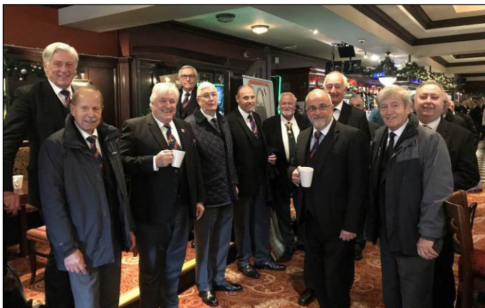
There is always a festive feel to December's Royal Ark Mariner Annual Assembly and Monday was no exception.

In keeping with tradition, the Surrey Brethren met up at the Shakespeare's Head in Holborn for refreshments before the meeting.