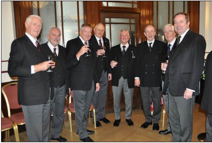
The Brethren then retired for refreshments.