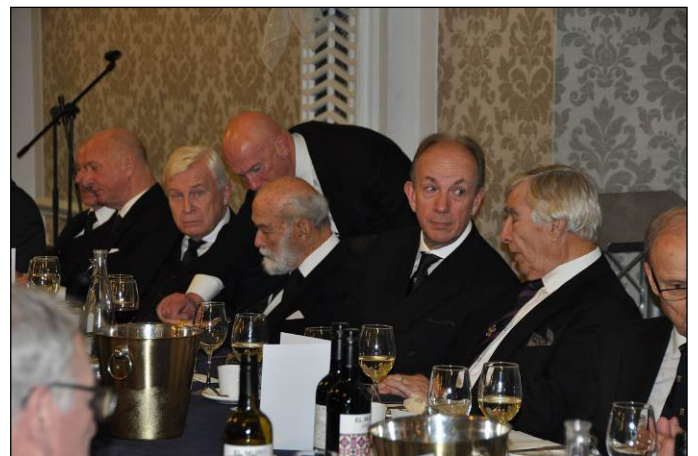
Many taking the opportunity to join the dining in the Grand Connaught Rooms, where they were pleased to drink the health of the Most Worshipful Grand Master in his presence and enjoy his response to his toast.