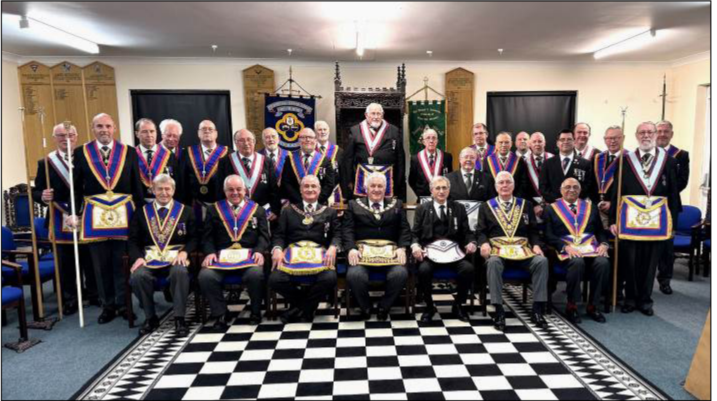
The Lodge was closed, and we retired to the bar for refreshments.