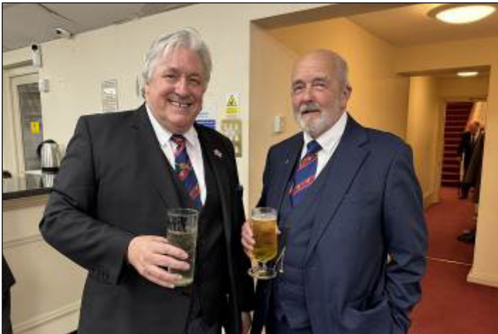
The Brethren of Lingfield Lodge and their guests then dined in perfect harmony at the Nutfield Masonic Centre.