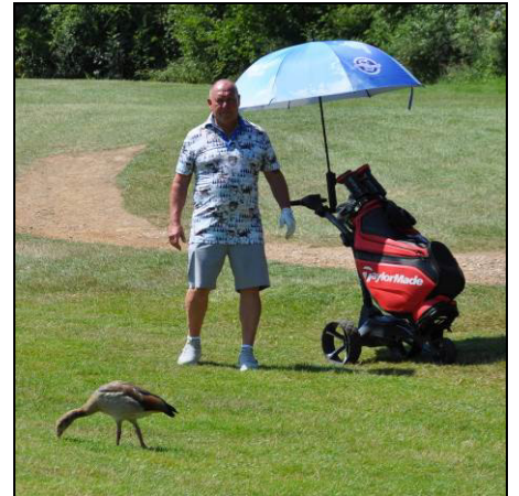
Where did my egg go?