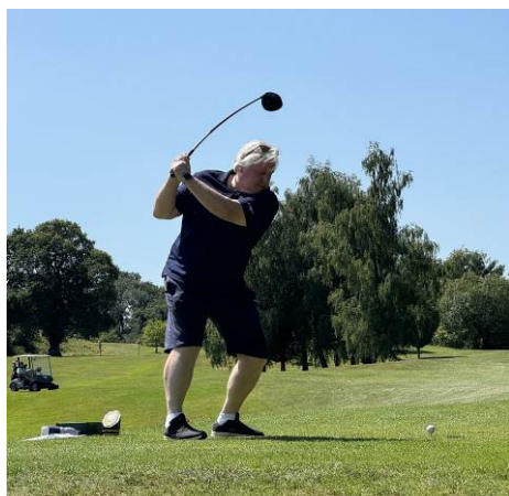
Please go long and straight for once