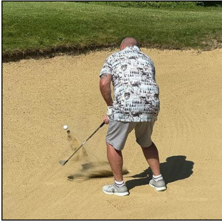
Those sideways shots are so difficult