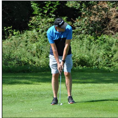
The steely look of a Pro