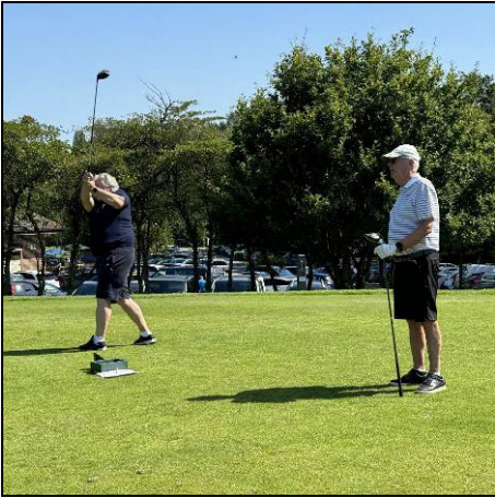
First off the tee