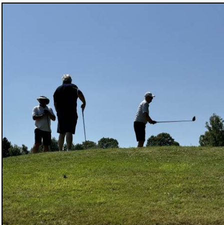
Half way round.