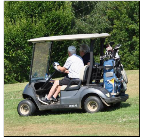
Has this thing got a sat nav?