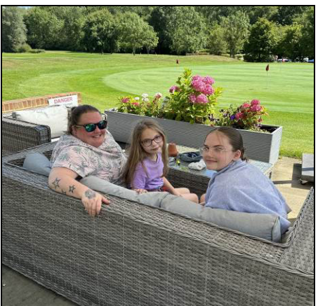
The family enjoyed the day