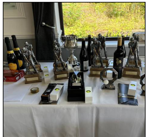
There were some fabulous prizes