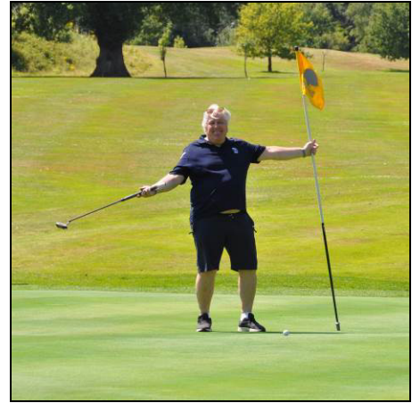
He's pleased with that.