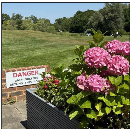
The best hole – the 19 th