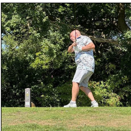
The winner in action