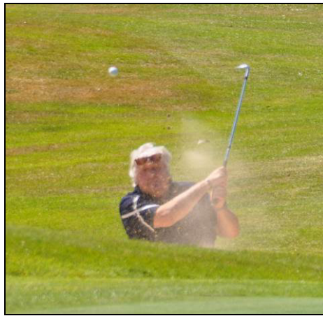
That's the way to do it