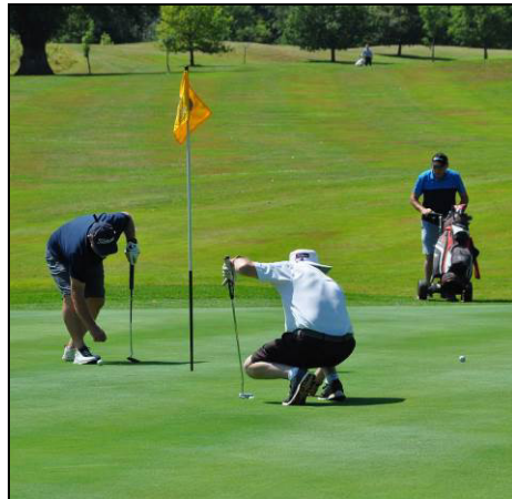
Some serious stuff