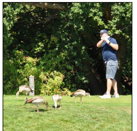
Mind the geese