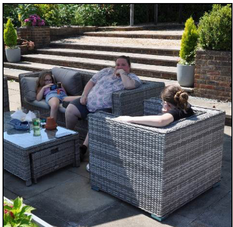
No better way to spend the day.