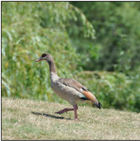
Someone's just picked up my egg