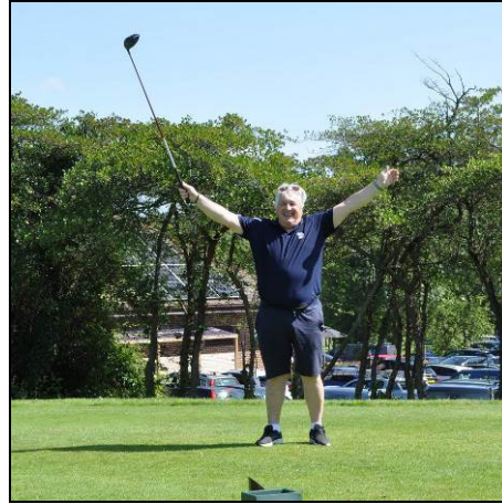
A great shot