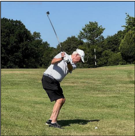
Perfect swing, but where did the ball go?