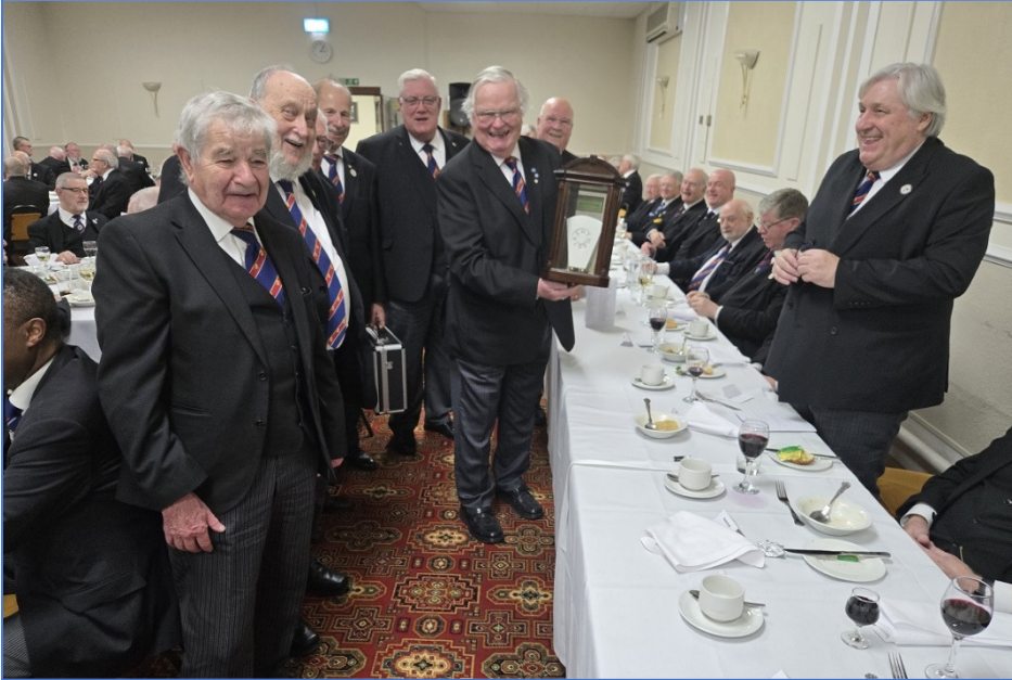
After the meal the Provincial Grand Master presented the Travelling Keystone to Weyside Mark Lodge No 442 as the Lodge with the highest percentage of members at the festive board.