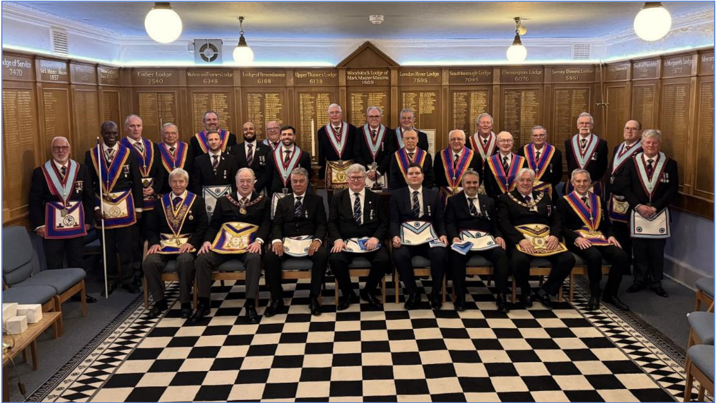
The Lodge was closed and we retired to the bar for refreshments before sitting down to an enjoyable meal together.