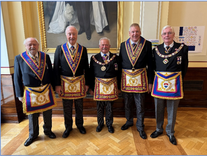
A group of Right Worshipful Brethren