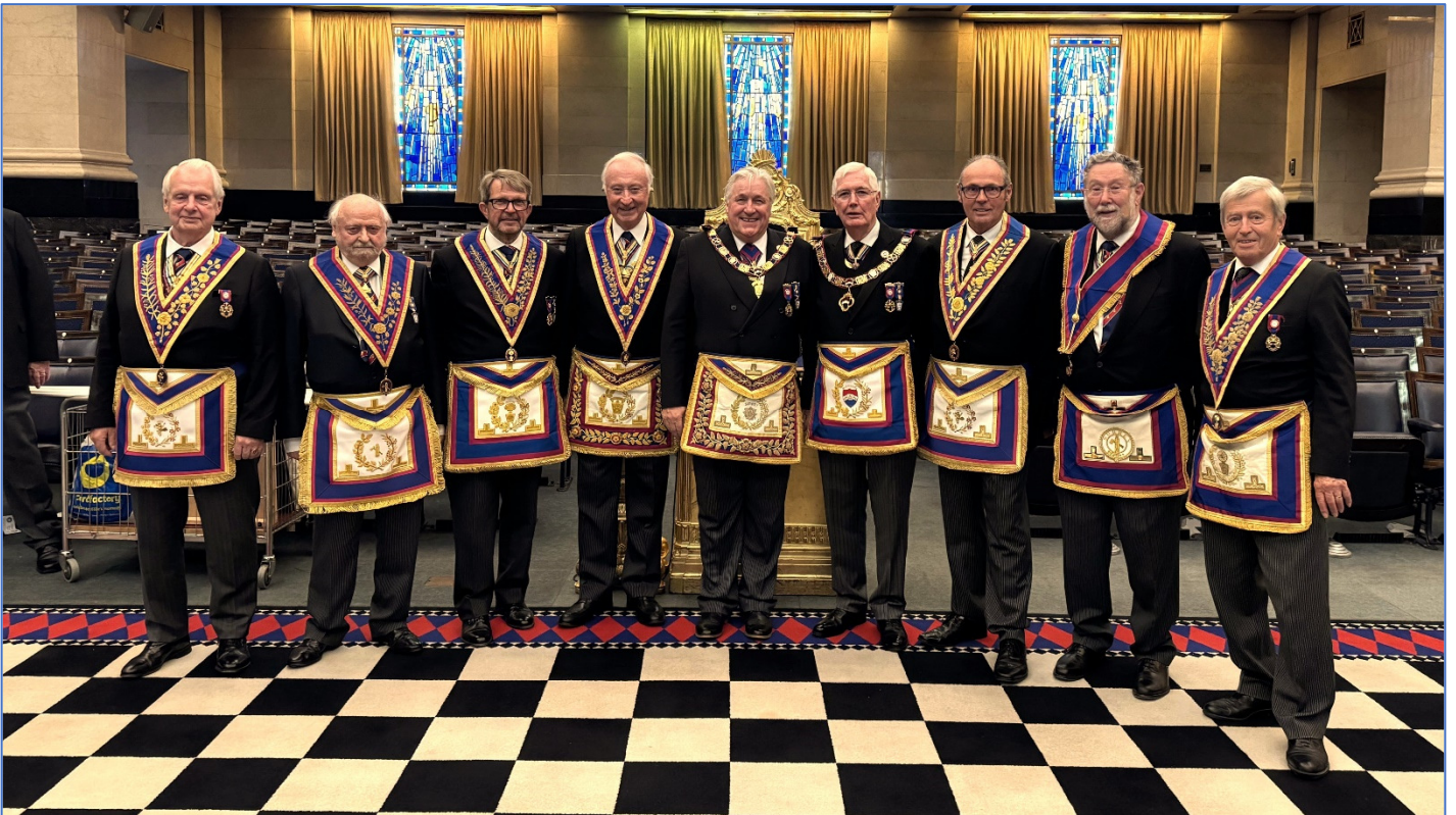
Some of the Surrey delegation