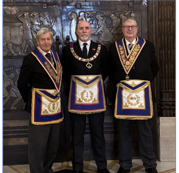
Outside the door of Grand Lodge